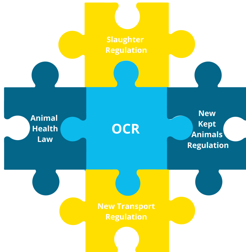
Figure 1 - How the new acquis for animal welfare can fit with the wider legal landscape